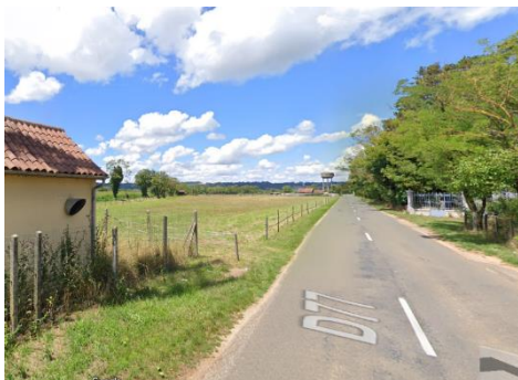
Entry of the parking on the left