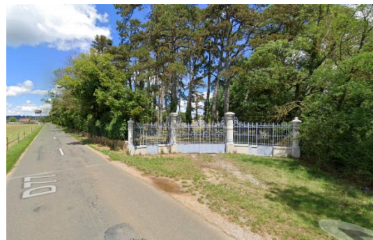
Entry of the camping on the right